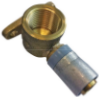
WET22 3/4" BSP x 22mm