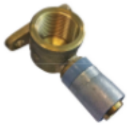
WET18 1/2" BSP x 18mm