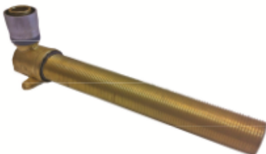
WMT222 3/4" BSP x 22mm x 200mm